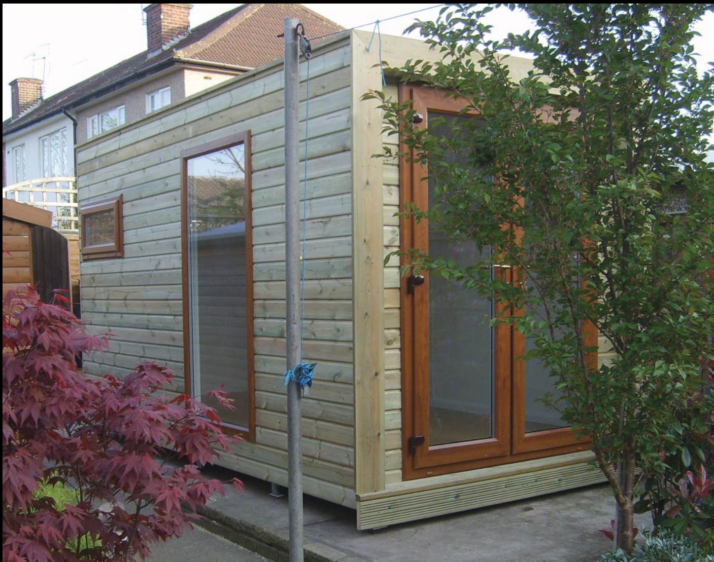
The Chelsea with Optional Picture Window