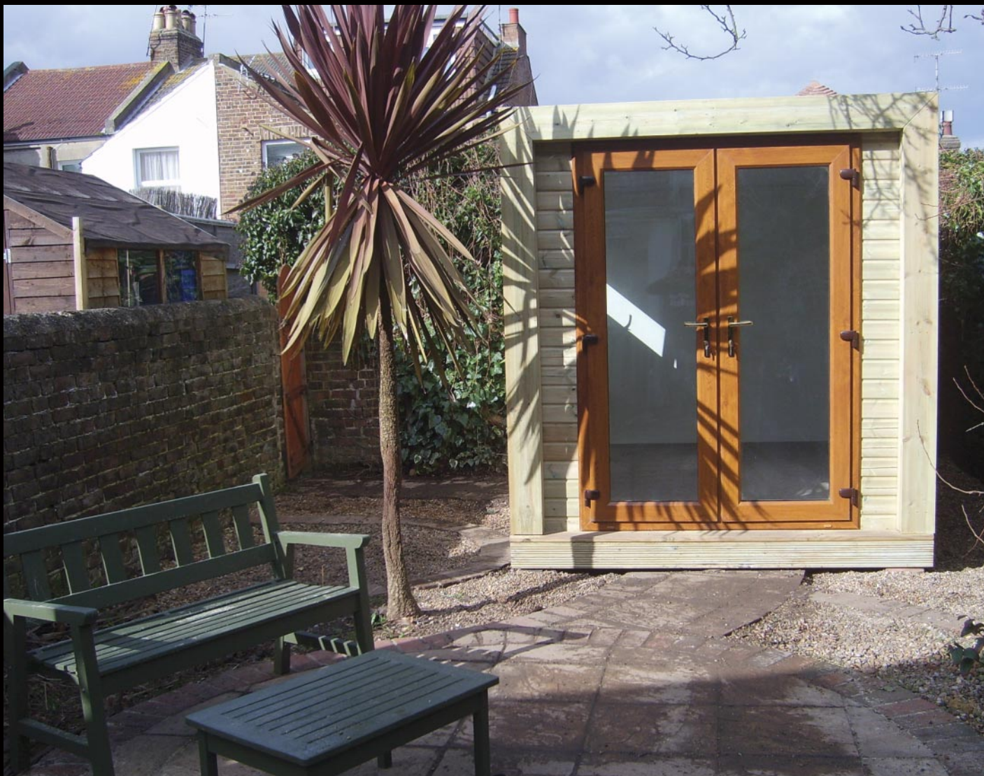
The Tatton with French Door Option