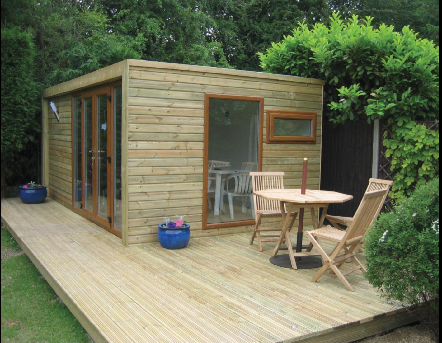
The Waddeson with Extended Decking, Picture Window and Electric Upgrade Options